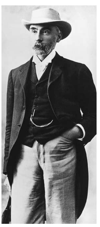
CY O'Connor c.1897

Gold was discovered firstly at Coolgardie in 1892, then at Kalgoorlie in 1893 and thousands flocked to the arid Goldfields. Water was scarce and became more expensive than whiskey. Water supplies, such as artesian bores and condensing plants, provided some but there was not enough for the thousands of diggers and their families. The lack of fresh water led to poor sanitation and diseases such as typhoid, which caused