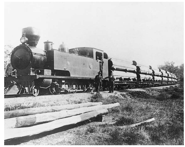
The pipes were 28 feet (8.5 m) long to fit the railway wagons