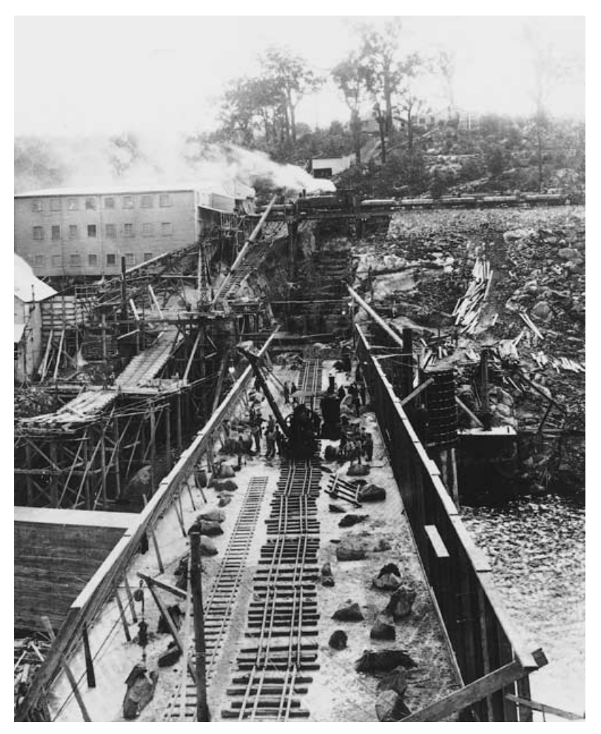
Building the weir wall showing 'plums' in the concrete 1900