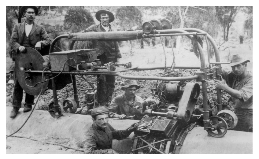
Caulking Machine, 1902