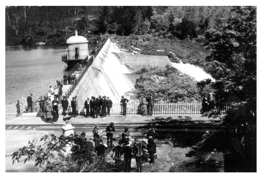
Overflow c. 1923