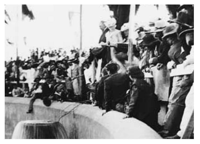
Mt Charlotte opening, 1901

concrete receiving/suction tank to hold water which flowed from the previous pump station and from which water was then pumped to