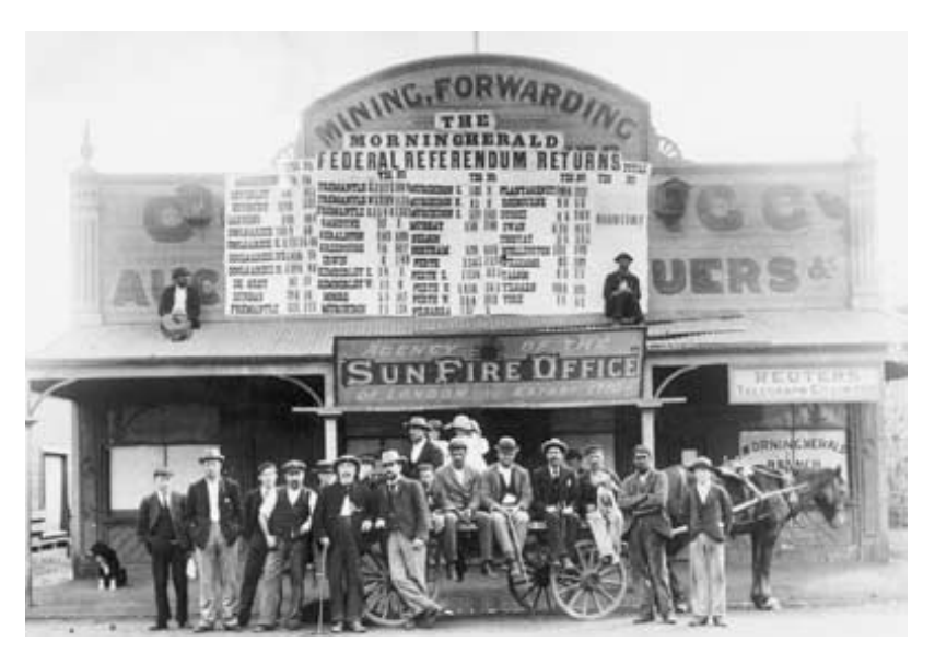
The Goldfields strongly supported Federation, 31 July 1900